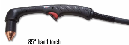
85° hand torch

Duramax Hyamp standard torch styles (for more torch options, see www.hypertherm.com )